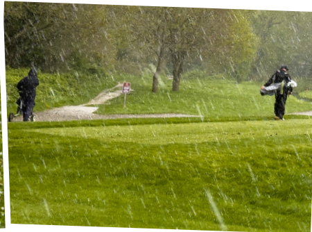
GOODBYE BLUE SKY: After a bright start, both the singles and afternoon greensome rounds were hit by stinging rain and hail