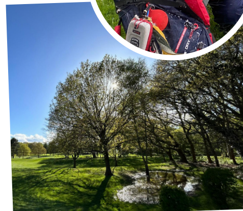
BRIGHT WITH OCCASIONAL SHOWERS: With spells of bright blue sky, you might have thought spring had sprung in mid-April in north London – until hail turned the greens white