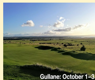
Gullane: October 1-3