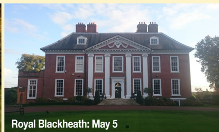
Royal Blackheath: May 5