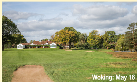
Woking: May 16