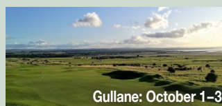
Gullane: October 1-3