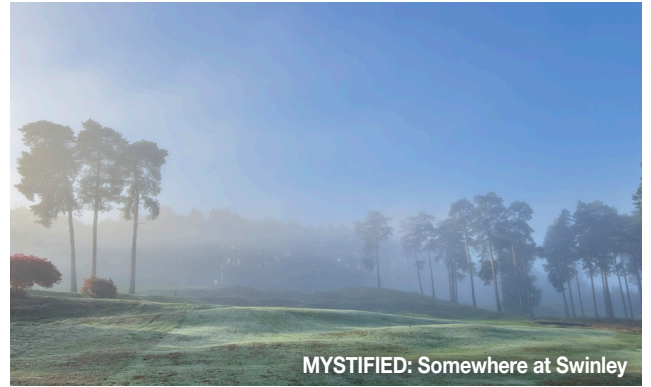
MYSTIFIED: Somewhere at Swinley