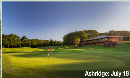
Ashridge: July 18