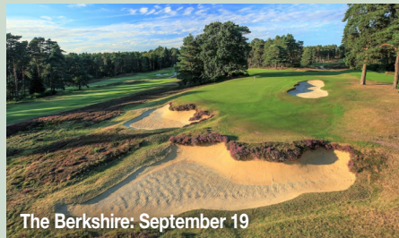
The Berkshire: September 19