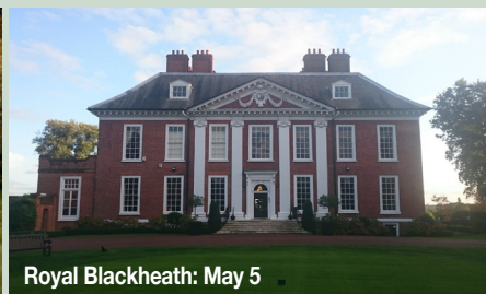
Royal Blackheath: May 5