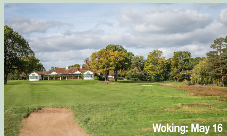
Woking: May 16