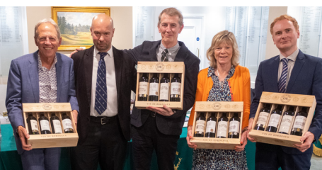
ON THE BERKSHIRE PODIUM: The runners up, and third place team members look all ready to party