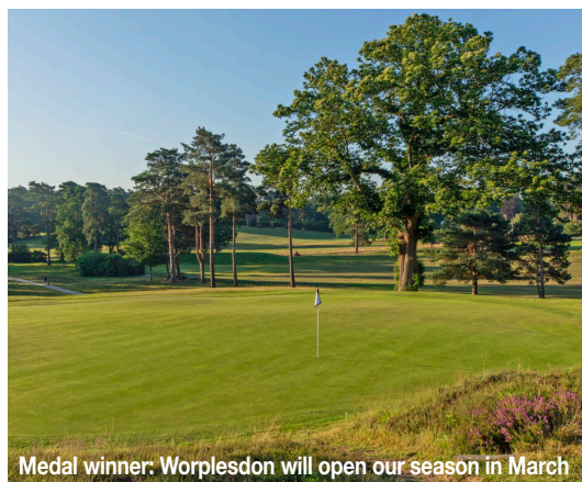
Medal winner: Worplesdon will open our season in March