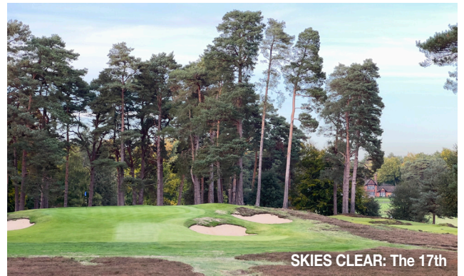
SKIES CLEAR: The 17th