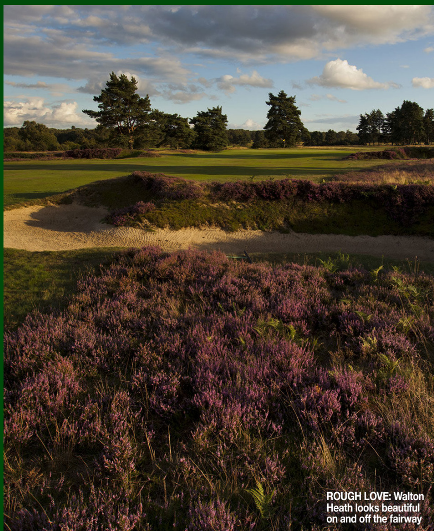
ROUGH LOVE: Walton Heath looks beautiful on and off the fairway