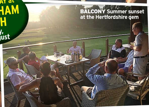
BALCONY Summer sunset at the Hertfordshire gem