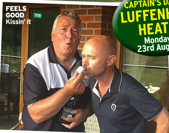
Next up... CAPTAIN'S DAY at LUFFENHAM HEATH Monday, 23rd August