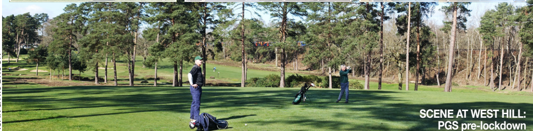
SCENE AT WEST HILL: PGS pre-lockdown