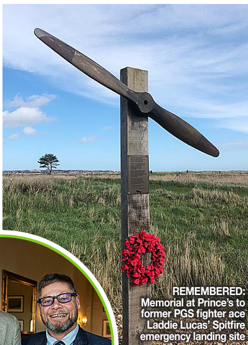
REMEMBERED: Memorial at Prince's to former PGS fighter ace Laddie Lucas' Spitfire emergency landing site