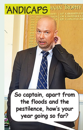
So captain, apart from the floods and the pestilence, how's your year going so far?