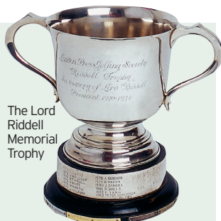
The Lord Riddell Memorial Trophy