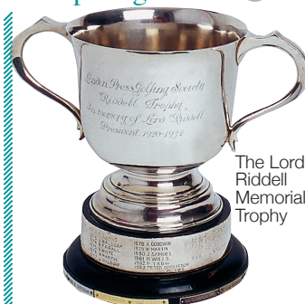
The Lord Riddell Memorial Trophy